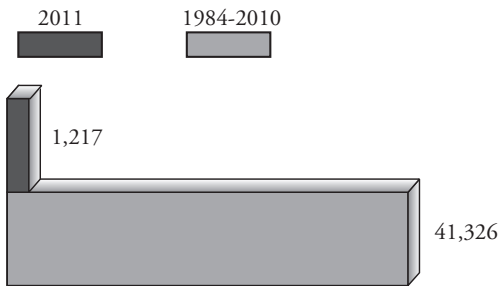
Number of businesses investing in enterprise zones