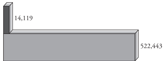
Jobs retained by businesses located in enterprise zones